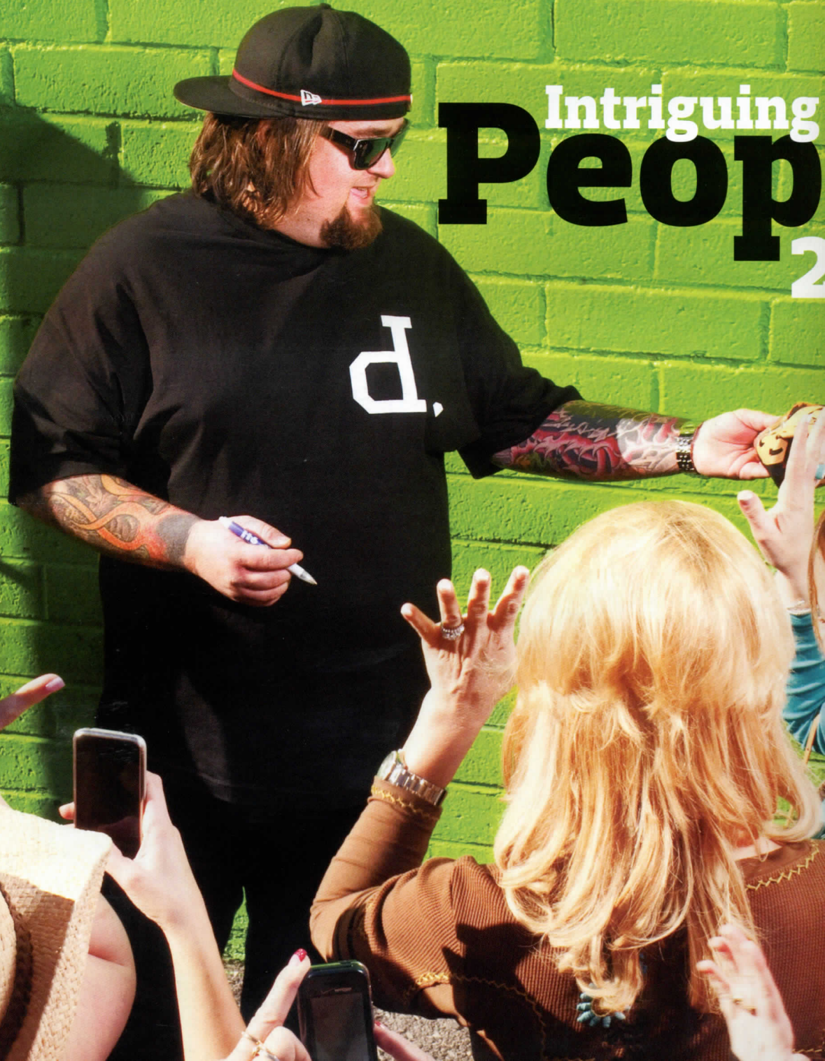
Austin "Chumlee" Russell reality show star